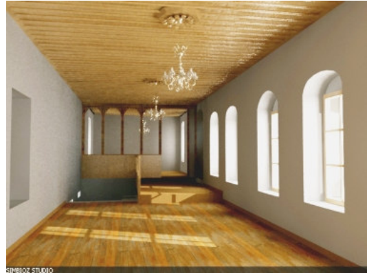
In the future

The restoration of the building will make way for a “Craft Incubator” – a traditional craft training centre. The Artisan Center is happy to have contributed as much as possible in this project as well as in enticing artisans to open their activities in the Gjirokastra Bazaar (two new craft shops have been opened on 2008 in the Bazaar area). During 2008, AC welcomed 3123 clients 42% of which became buyers.